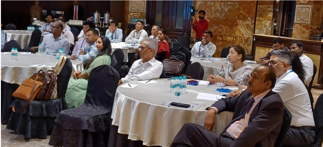
Training Course on FIDIC Conditions of Contract

claims – preparation, submission, assessment, determination under FIDIC Contracts, and how disputes could be prevented or otherwise resolved.