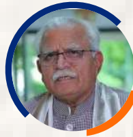
Shri Manohar Lal Khattar Union Minister Ministry of Housing and Urban Affairs