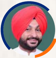
Shri Ravneet Singh Minister of State Ministry of Railways (R)