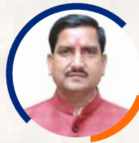
Shri Tokhan Sahu Minister of State Ministry of Housing and Urban Affairs