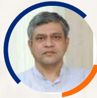
Shri Ashwini Vaishnaw Union Minister of Railways Govt. of India