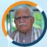
SHRI MANOHAR LAL KHATTAR Union Minister Ministry of Housing and Urban Affairs