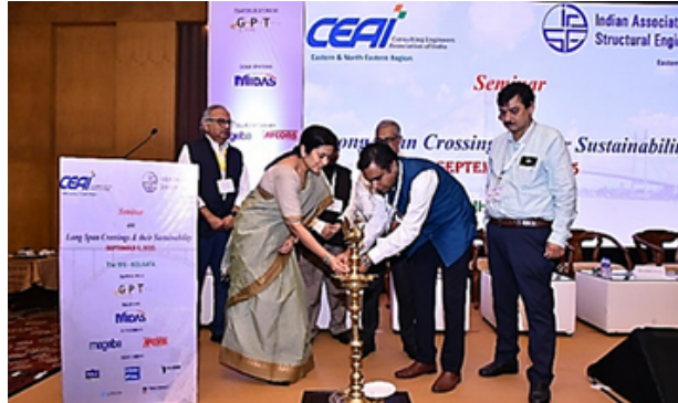
Lighting of the Lamp by the dignitaries