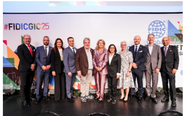
FIDIC Board Members

During GAM, the result of the election held for the new Board Members were announced. The elected members are as follow: